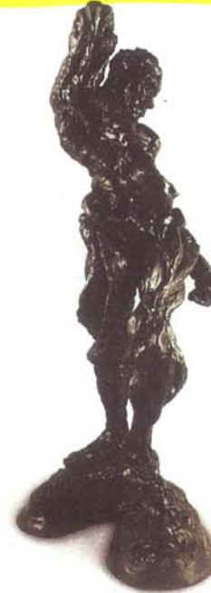
Volume 5 Issue 2 - 2007