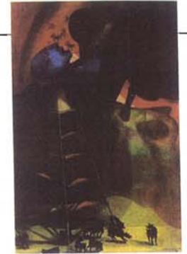
Clockwise from above: Dennis Campay, Blue Line , 2007, 60 x 36 inches, Mixed media on canvas mounted on wood; Cesar Menendez, El sueño de los guardianes , 2004, 71 x 47 1/2 inches, Oil on canvas; Barbara Rehg, Foundation Series #18 , 2006, 30 x 22 inches, Mixed Media; Molly Sawyer, Marco , 2006, 13 x 11 x 31 inches, Cast Hydrocal